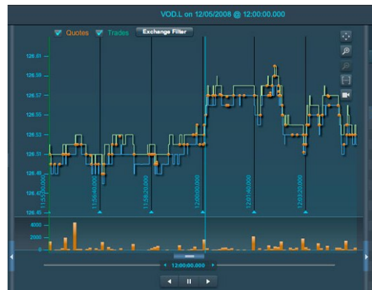
10 minute replay